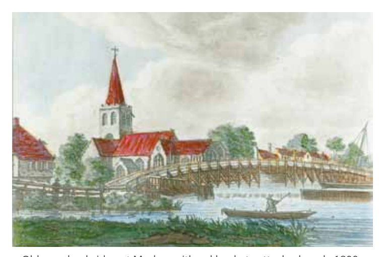
Old wooden bridge at Marlow with eel buckets attached, early 1800s

If you look to your right across the river you can see the 'new' bridge that was built in 1873. When the old wooden bridge was superseded by its shiny new rival, St Peter's Street became a dead end and began its transformation into the well-to-do quiet, residential area it is today.