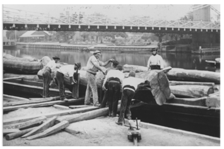
Bargemen loading logs at Marlow - early 1900s